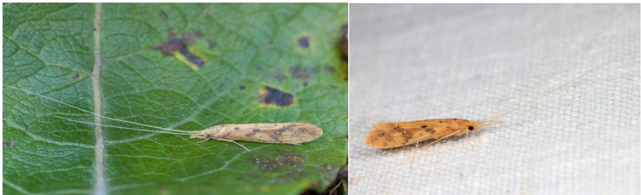
Figure 1. Parasetodes respersellus from Lithuania (left, photo by Ž.P.) and from Latvia (right, photo by U.P.)

Birzgale 23 08 2022, 1 ♀ (U.P.); Carnikava, 21 08 2022, 2 specimens, one ♀ of which was left to the collection (N.S.); Raveliai, 21 09 2018, 1 ♂ (Ž.P.); Stūpnieki, 18 08 2022, 1 ♂ (U.P.).