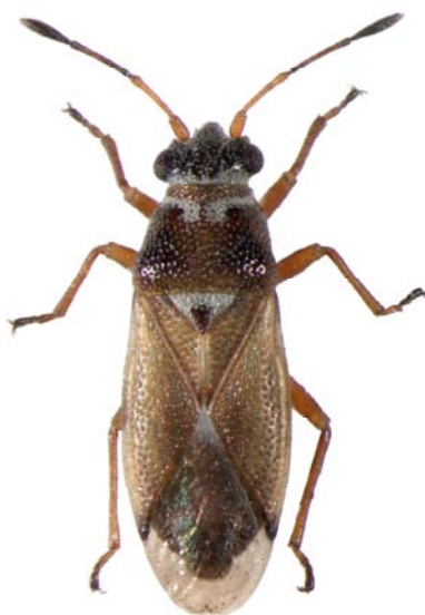
Figure 1. Adult insect of Cymus melanocephalus Fieber, 1861.

A map (Fig. 2) of the collecting site of C. melanocephalus was generated in R version 4.0.4 (R Core Team, 2021), using the ggplot2 (Wickham, 2016), the ggspatial (Dunnington, 2021), the rgdal (Bivand et al. , 2021), and the sf (Pebesma, 2018) packages.