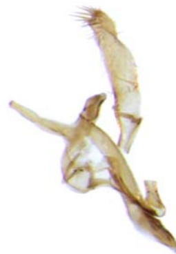
Fig. 5. Ascalenia viviparella Kasy, 1969, a – imago, b – male genitalia, photo R. Markevičiūtė