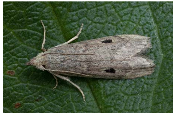
Fig. 4. Paralipsa gularis (Zeller, 1877), photo Ž. Pūtys