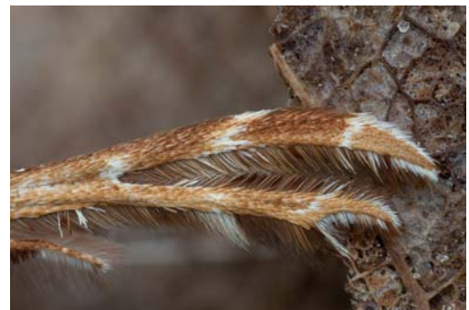
Fig. 6. Oxyptilus tristis (Zeller, 1841), a – imago, b – fragment of forewing, photo Ž. Pūtys