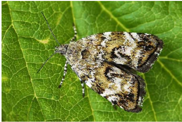
Fig. 1. Choreutis diana (Hübner, 1822)