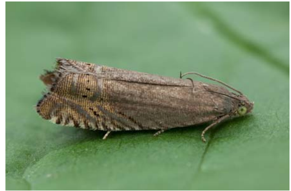
Fig. 2. Grapholita gemmiferana (Treitschke, 1835)