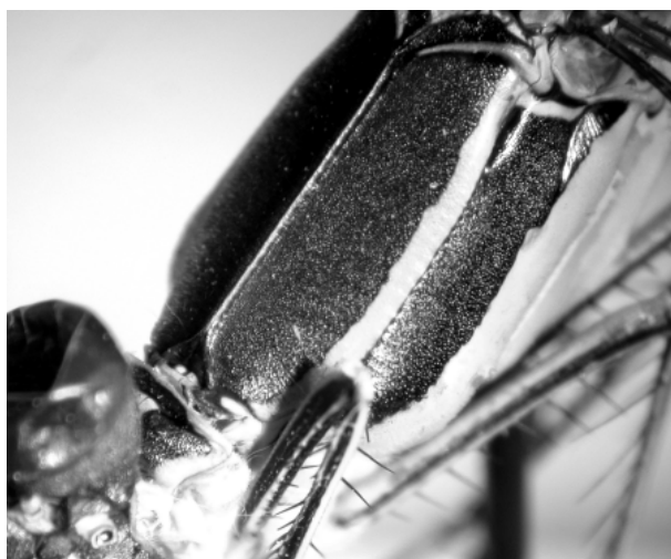
Figure 2. Thorax of Lestes barbarus , anterolateral aspect.

Although exuviae or larvae of L. barbarus were not found in Lithuania up to now, the capture of a recently emerged female implies the presence of permanent population of the species in the South of Lithuania with high probability. This suggestion is supported by observations that adults of L. barbarus tend to return for breeding to the same pond where they have emerged (Corbet, 2004).